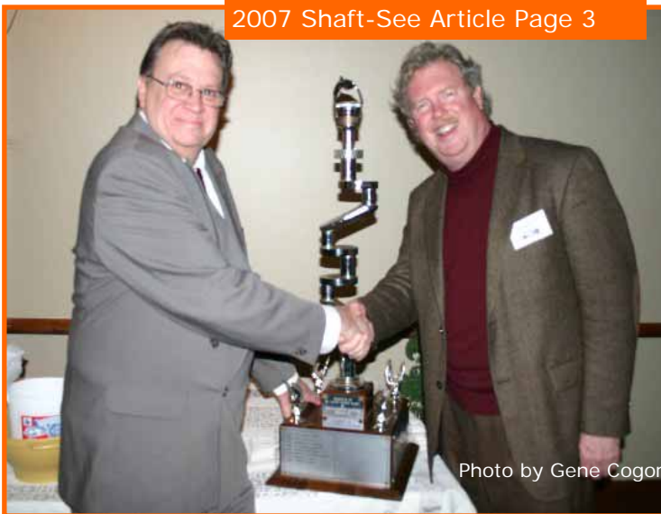
2007 Shaft-See Article Page 3